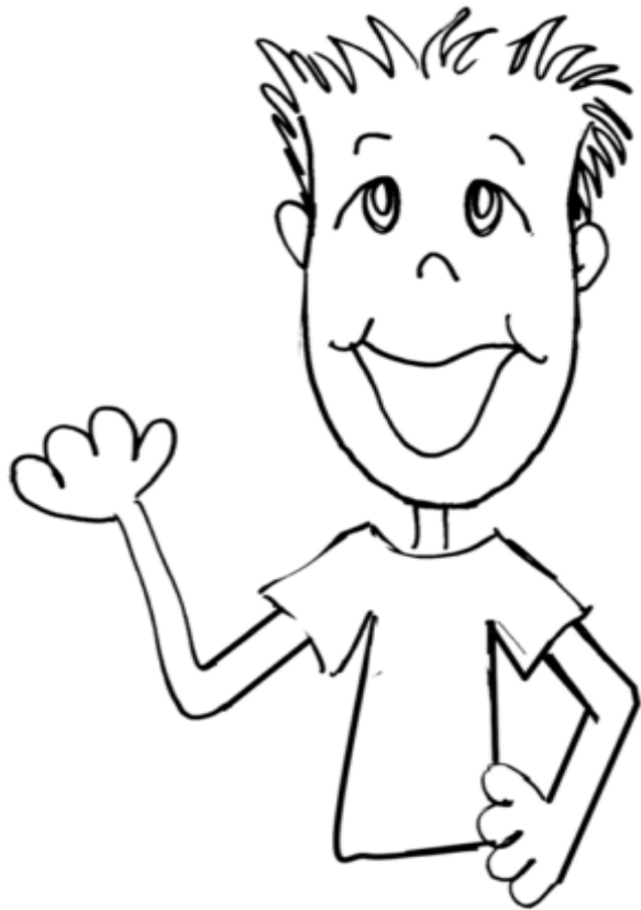
Crookes and Jenkins Dental

My Name is _____ and I am ____ years old. Today I will visit the dental surgery. My dentists name is Dr _____.