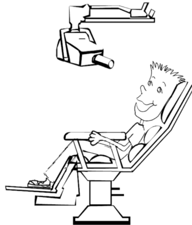
Crookes and Jenkins Dental

Dr _____ let's me sit in a special chair that's just my size. I get to see the tooth camera and learn how easy it is to take tooth pictures.