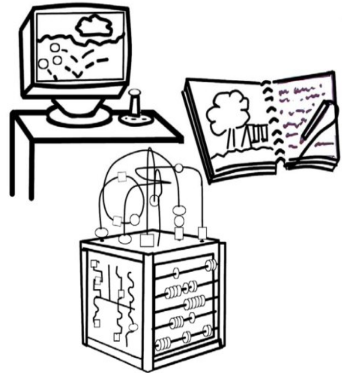
Crookes and Jenkins Dental

I will have fun with toys and books while I wait for my turn.