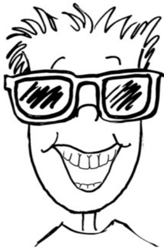
Crookes and Jenkins Dental