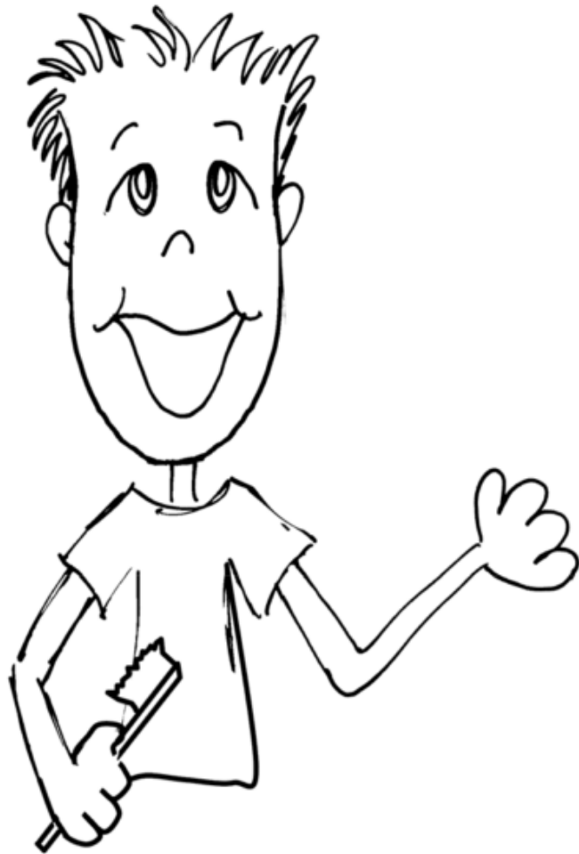
Crookes and Jenkins Dental

I had so much fun, I can't wait for my next visit to the dentist.