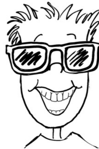
Crookes and Jenkins Dental