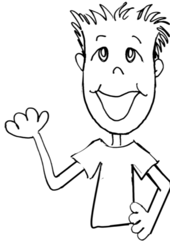
Crookes and Jenkins Dental

My Name is _____ and I am ____ years old. Today I will visit the dental surgery. My dentists name is Dr _____.