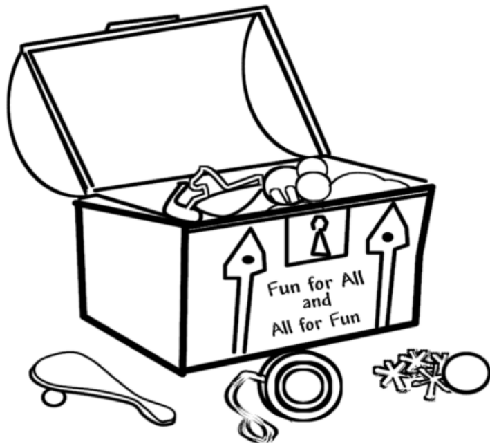
Crookes and Jenkins Dental

"Bye, _____", says Dr _____ and the helpers.